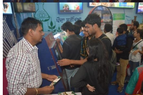
Glimpses of Trade Fair